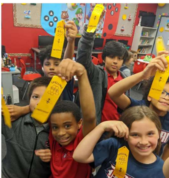
August 3, 2022